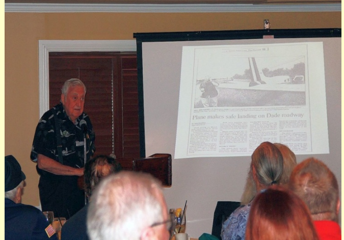
Landing his plane on the roadway !