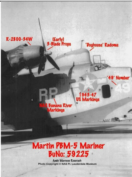
Martin PBM-5 Mariner BuNo: 59225