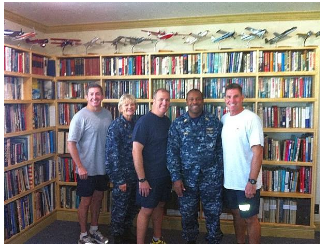
VTU0808G Navy Reservist Unit at the finished Library