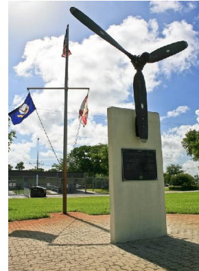
This monument will be relocated to the grounds of the Museum