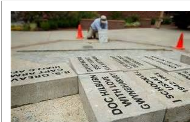
Memorial Brick Pavers in light-gray with one, two or three lines in black text

You can play an important role in preserving the spirit of naval aviation by purchasing a personally engraved brick paver for the new area of the Flight 19 Memorial Monument . This monument will be relocated from Navy Park to the grounds of the Naval Air Station Fort Lauderdale Museum (sometime around 2014), where it will be displayed for all who pass through to see. Whether celebrating a graduation, memorializing a loved one, or commemorating a retirement, we all have a story to tell. Memorial Bricks are engraved with your personalized message, with one, two or three lines. You will receive a certificate of ownership and location map when the brick is installed. All funds raised from Memorial Bricks sales support the Museum. Your personal message becomes a lasting gift and a piece of history at the Naval Air Station Fort Lauderdale Museum. Keep the Spirit alive, with your Memorial Paver! You can fill the form supplied in this newsletter, or check-out with PayPal by visiting our website: Memorial Bricks Program