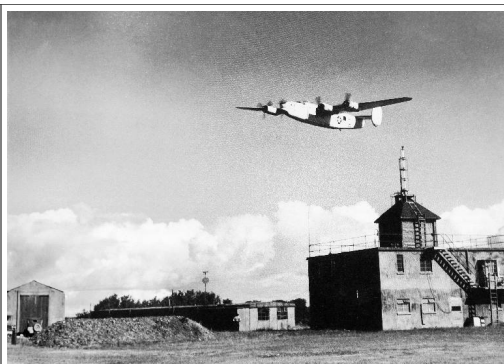
B-24 Liberator flying over the control tower at Dunkeswell Airfield, 1940's