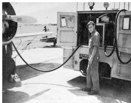
Refueling aircraft, Wheeler Field, 1941