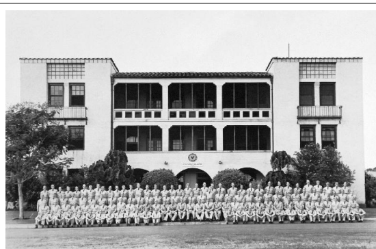
19 th Pursuit Squadron Wheeler Army Field, Territory of Hawaii, 1939