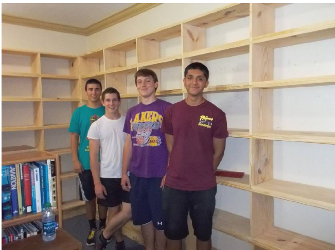
Boy Scouts from Troop #190 finished the wall to wall custom-made bookcases for the Museum's Library.