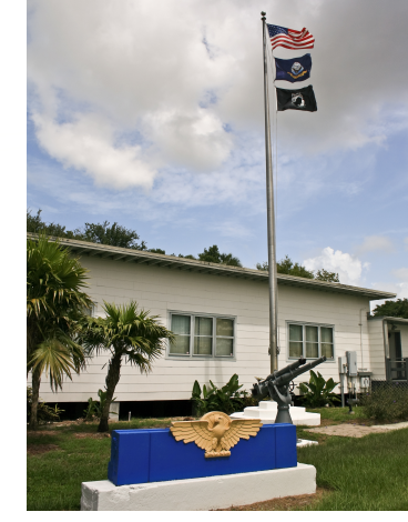
The historic Link Trainer Building # 8, home of the Naval Air Station Fort Lauderdale Museum.