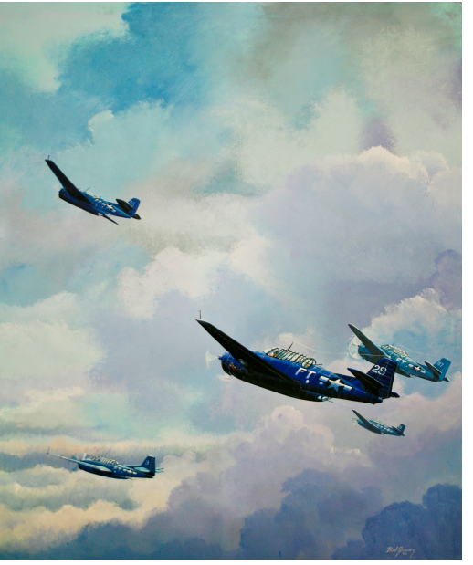
Over the Bermuda Triangle "Flight 19" oil painting on exhibit